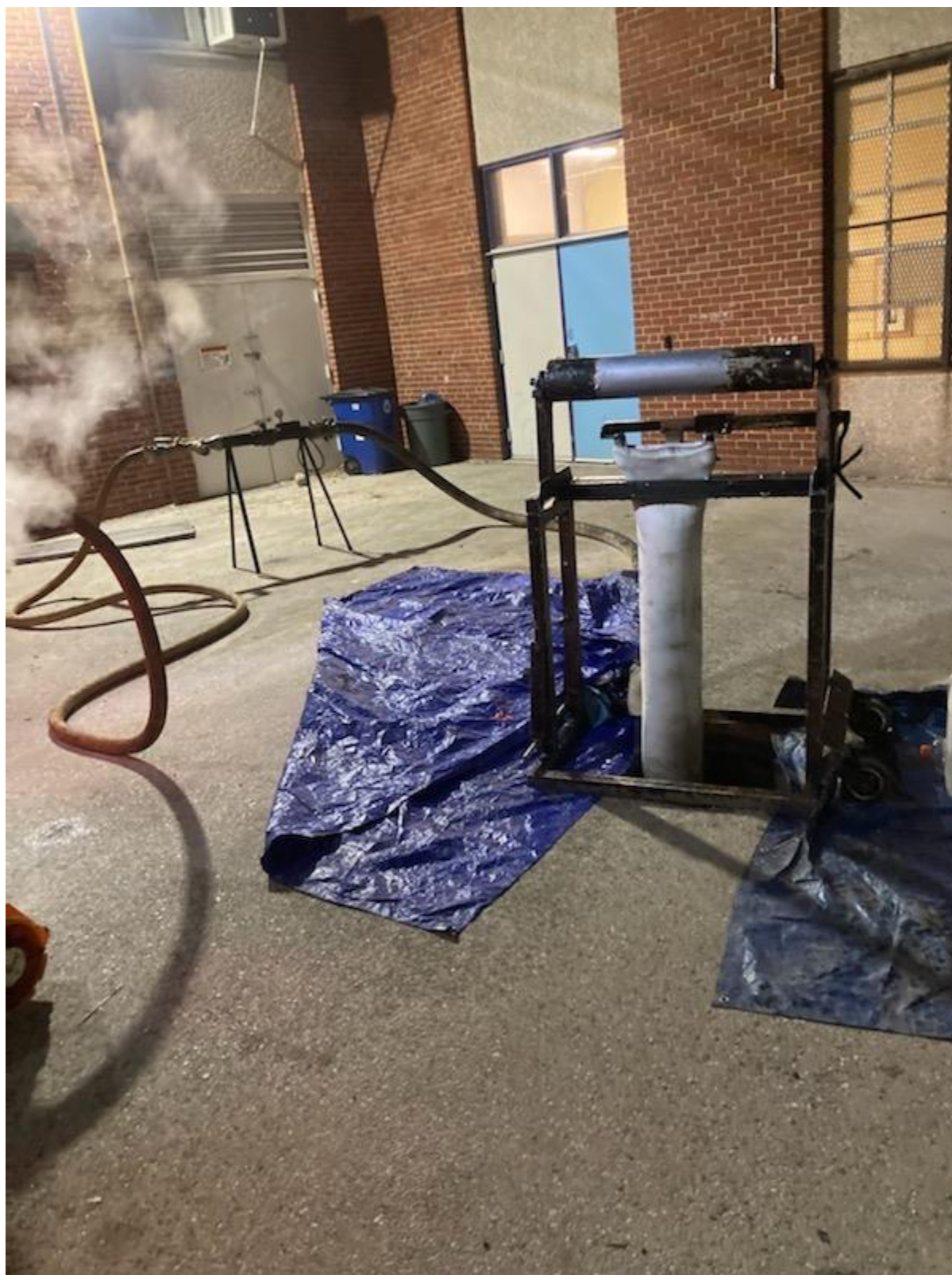
Figure 3-4: SC 941 – Sewer lining