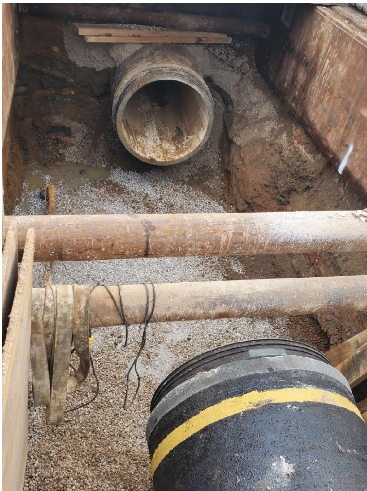
Figure 3-2: SC 941 – 48" Force Main