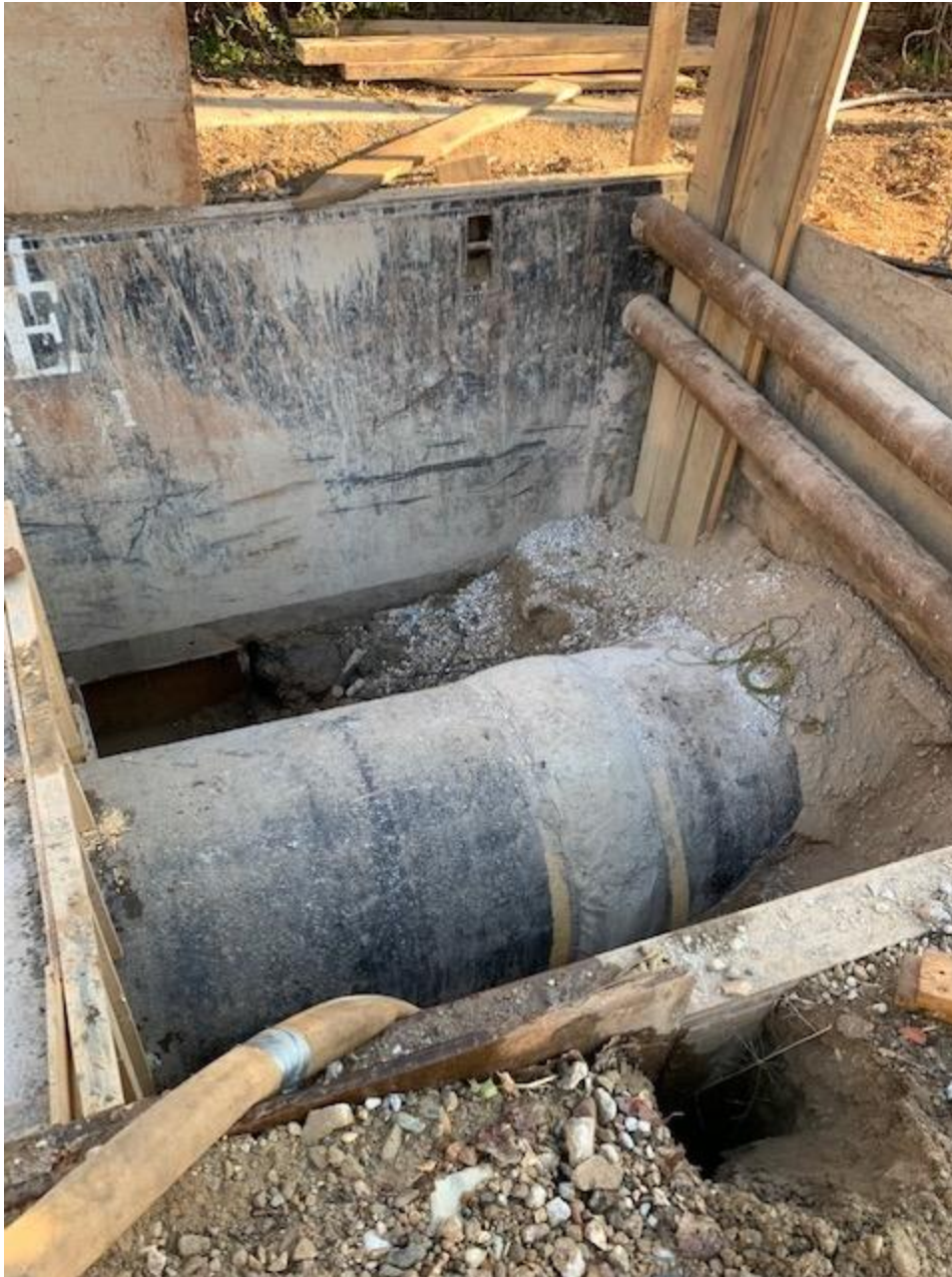
Figure 3-6: SC 941 – 48" Force Main