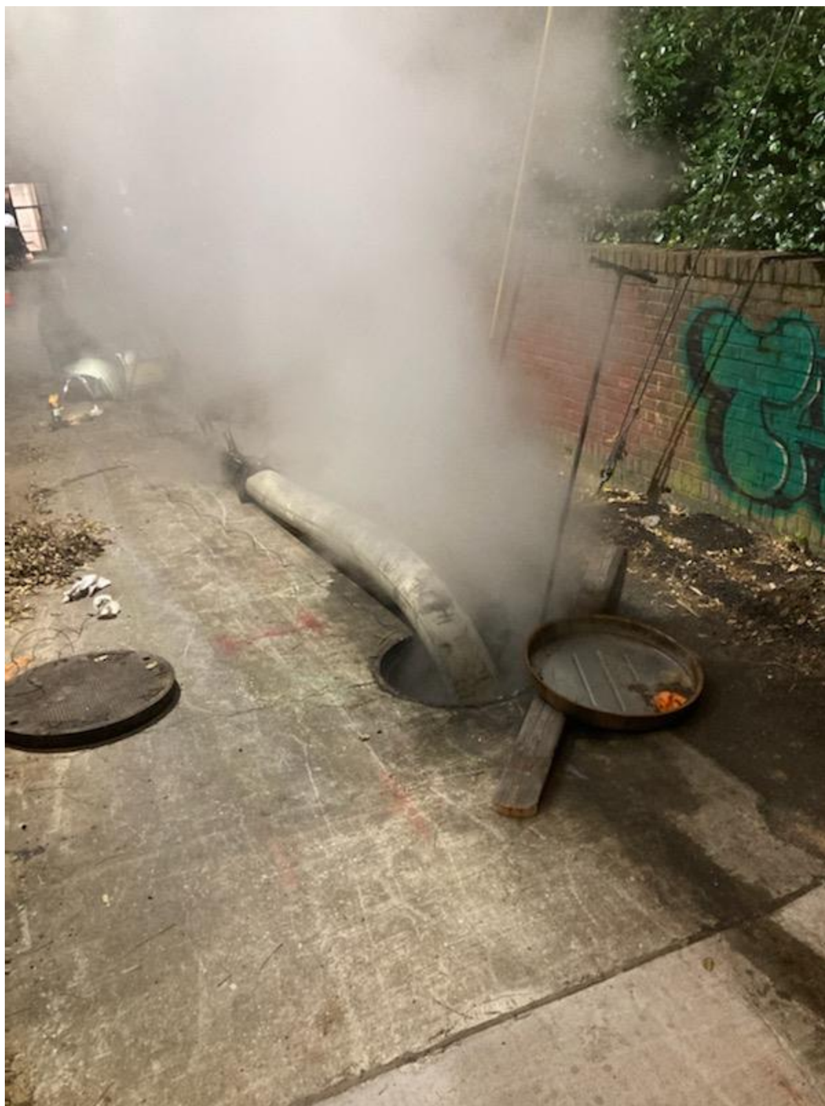
Figure 3-3: SC 941 – Sewer lining