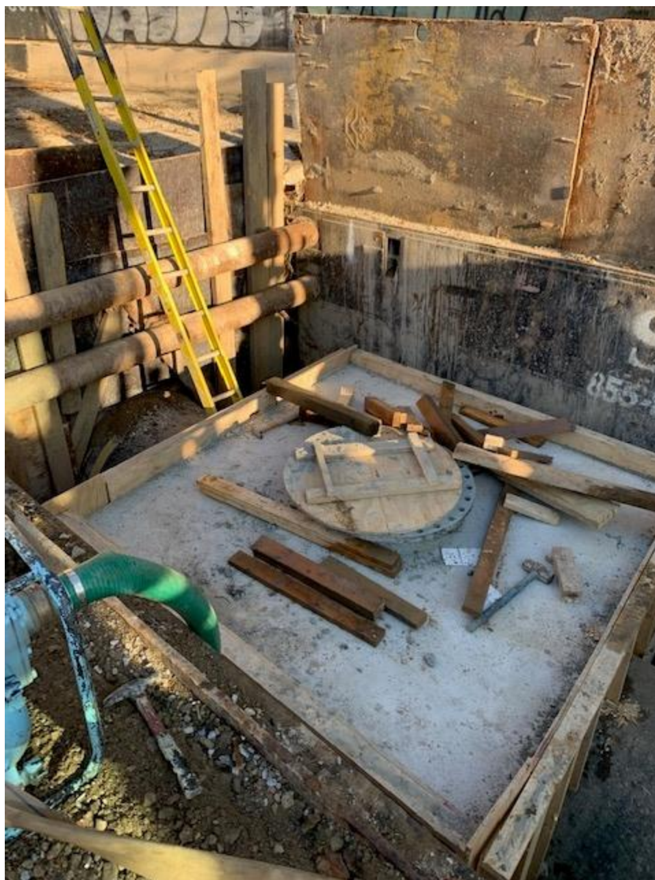
Figure 3-5: SC 941 – Vault 2